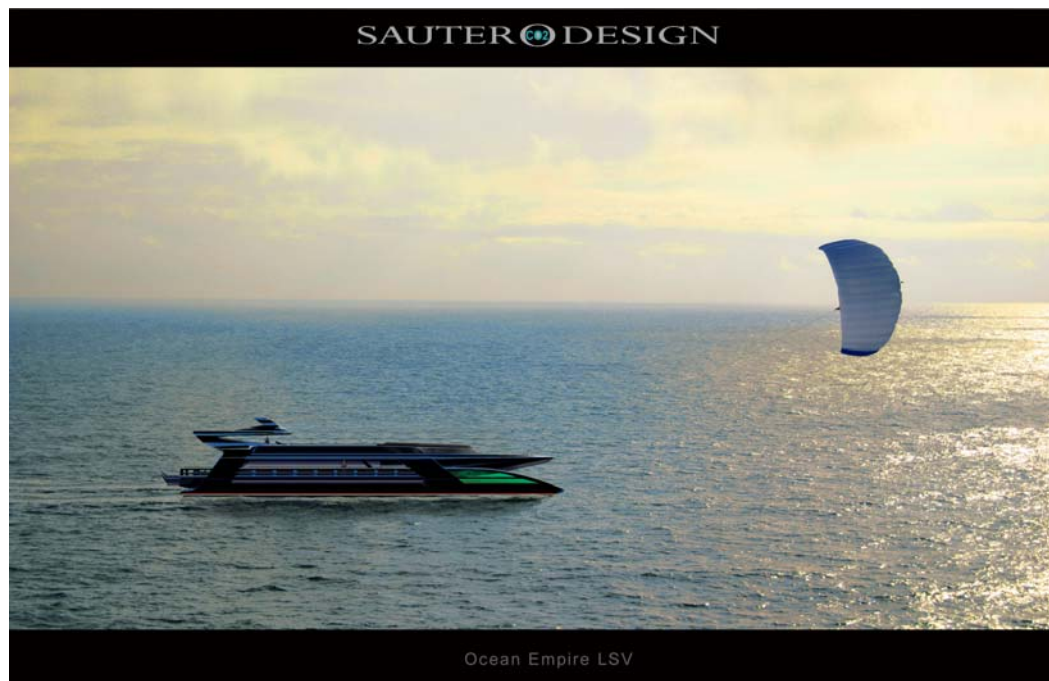
Figure 2: The Ocean Empire LSV

Today we find that the very same marine environment that challenges the design elements of ocean going vessels is also capable of generously rewarding voyagers with an unlimited supply of clean energy.