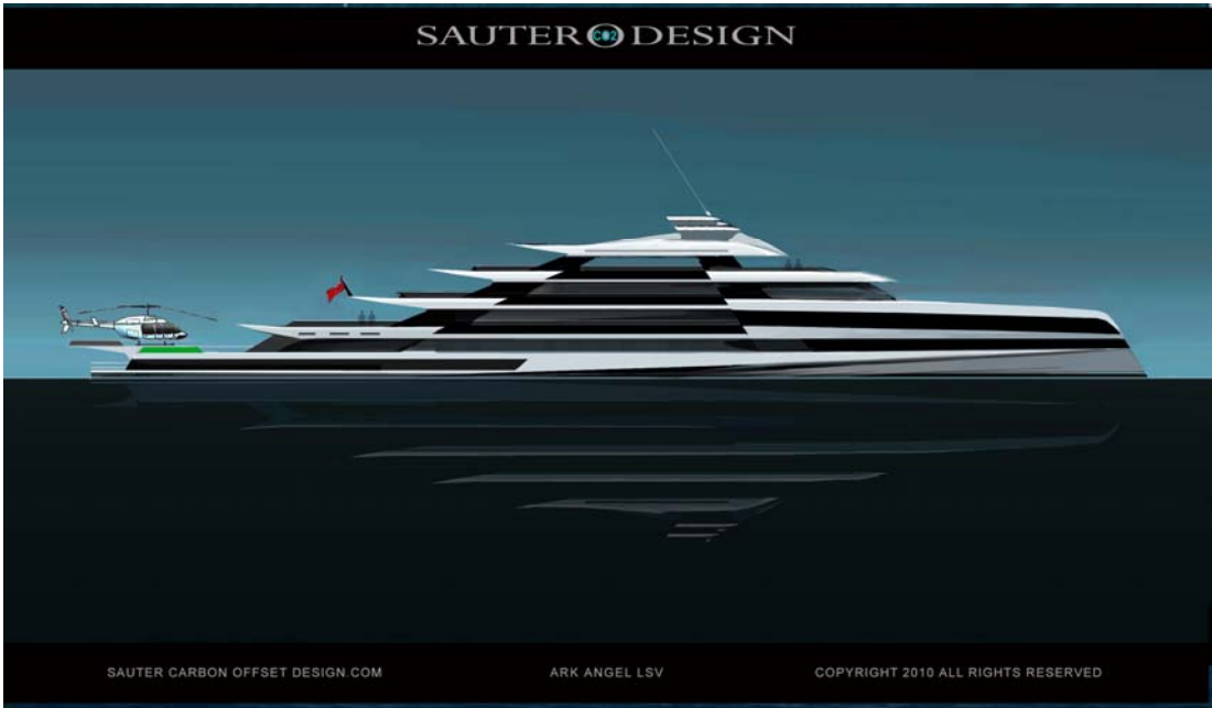
Figure 5: The Ark Angel LSV

The 44m Formula Zero, the 50m Transcendence, the 60m Super Nova and the 60m Ocean Empire LSV and The 78m Ark Angel LSV.