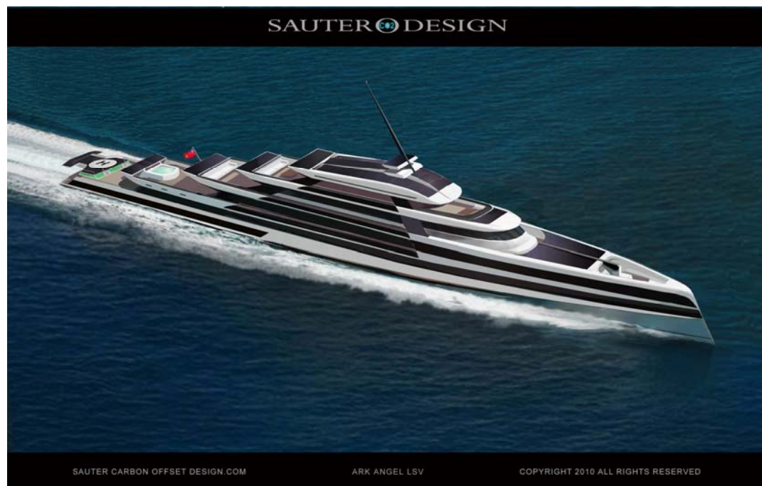
Figure 4: The Ark Angel LSV

For those that think that high efficiency displacement hulls don't apply to lower aspect ratio mono-hulls, there are the 55 knot, 16 and 22 meter SBS vessels that successfully challenge that notion.