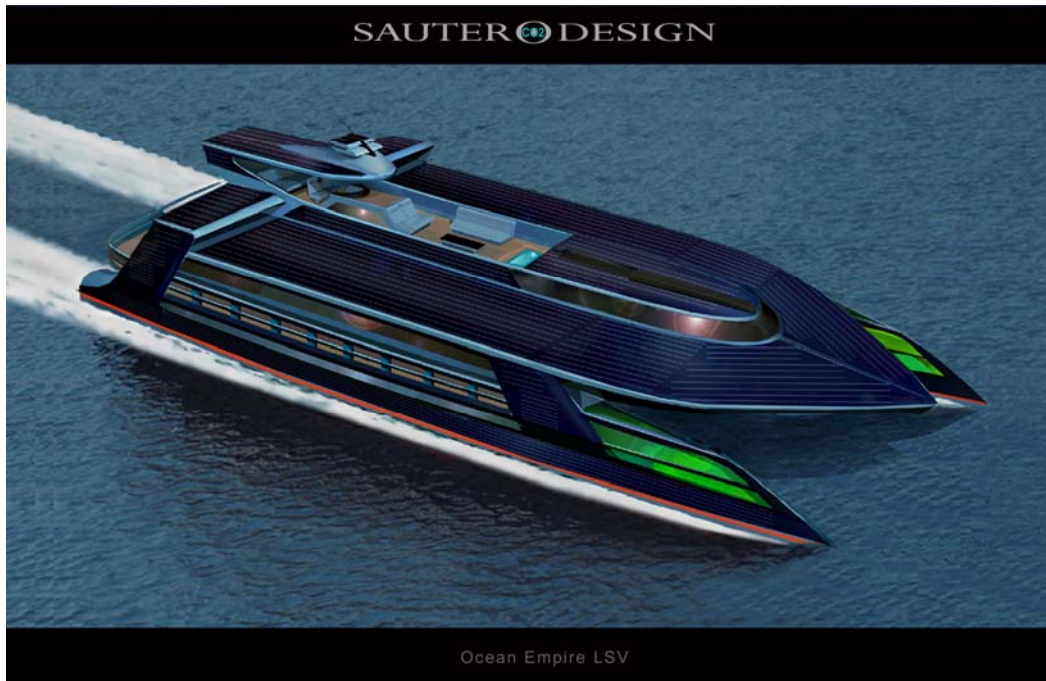
Figure 1: The Ocean Empire LSV

The Ocean Empire LSV (life support vessel) points to the innovative use of existing technology that will transform Super & Megayacht vessels into self sufficient ocean going platforms. We look at how combining advanced aero and hydrodynamic principles with Emax Solar Hybrid technology enables Superyachts to achieve a 50% to 100% reduction in GHG emissions by harnessing the collective maritime resources derived from the sun, wind, waves, currents and life in the sea.